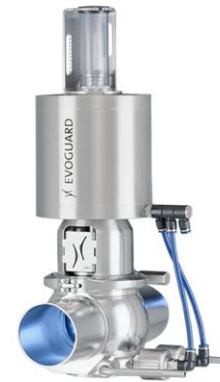
Double Seal Valve