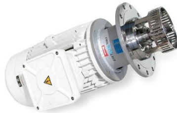
Bottom Entry Mixer