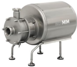
In Line Mixer