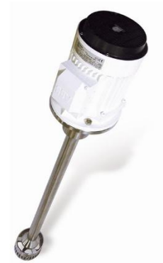
2 Stage Mixer