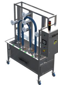
Ab6 Flex Pigging for hoses