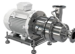
Hygienic centrifugal pump HSCP - single stage, self-priming