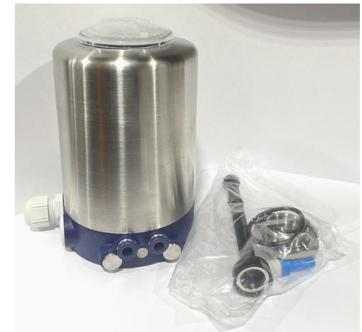
24V DC / ASI – Optional as a control head