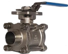
3 Way Valves