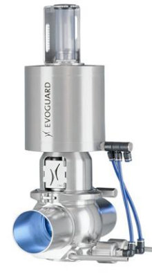
Double Seal Valve