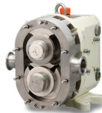
JMU - EHEDG