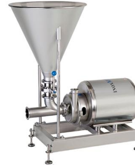
Solid Liquid Mixer