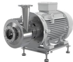
Hygienic centrifugal pump H1CP - single stage, non self-priming