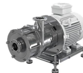
Hygienic centrifugal pump HMCP - multistage, non self-priming