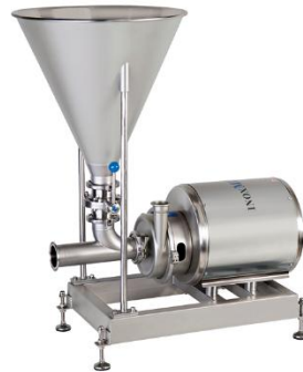
Solid Liquid Mixer