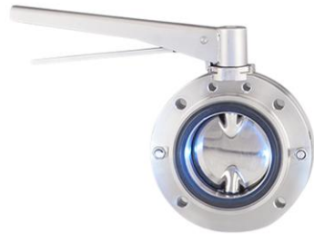
Butterfly Valve Manual Actuator