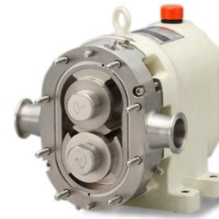
AMXN - ASEPTIC