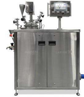
Laboratory Scale Mixer