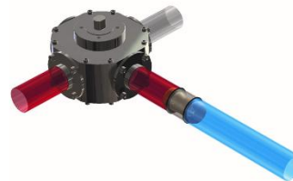
3 Way Valve Pigging