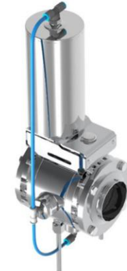
Double Seat / Block and Bleed Valve