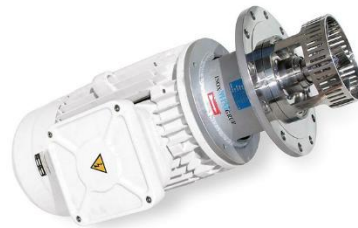
Bottom Entry Mixer