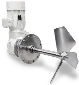
Side Entry with geared pump