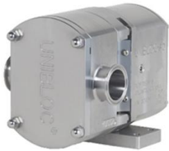
Rotary Lobe Pumps