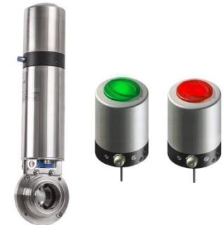
Actuators & Control Heads