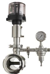
Clean in Place Pigging