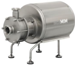
In Line Mixer