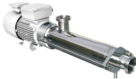
Progressive Cavity Pump