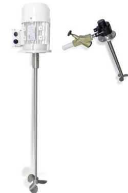
Vertical Mixer with Pneumatic Drive